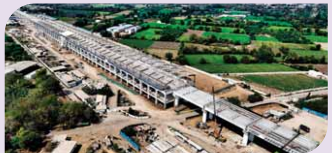
Under Construction Anand Bullet train station

The meticulously planned route encompasses strategic stops at key cities, including Thane, Virar, Boisar, Vapi, Bilimora, Surat, Bharuch, Vadodara,