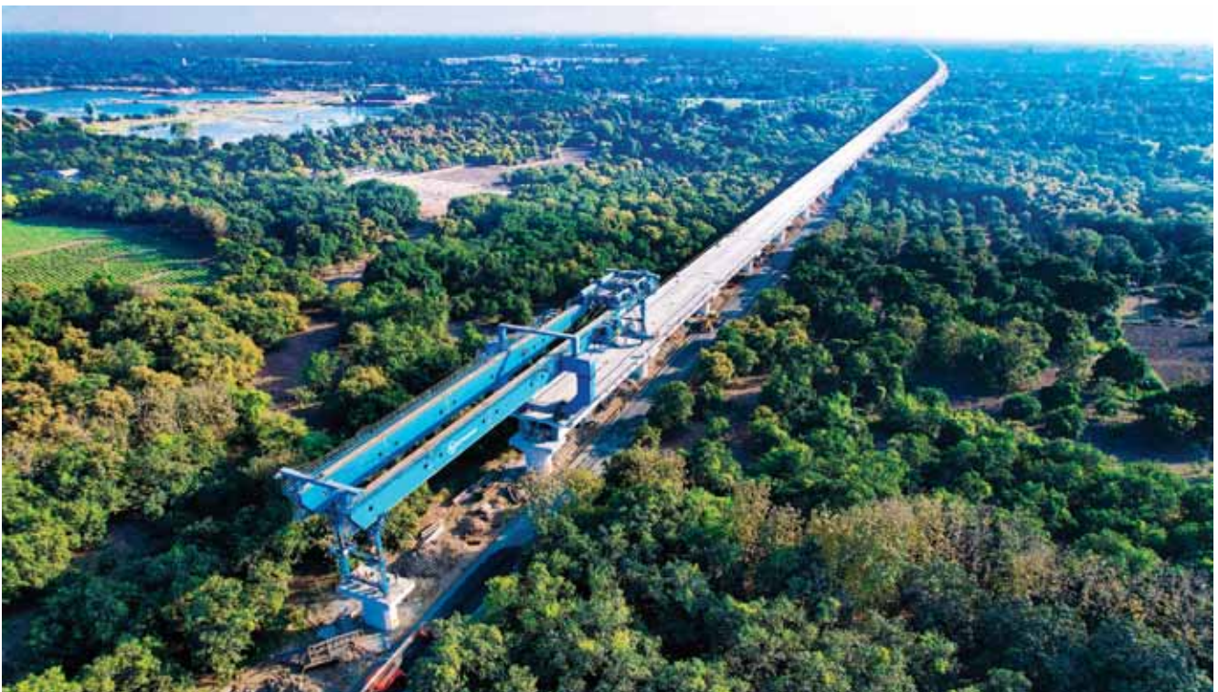
Viaduct construction work in progress

With comfort and convenience at the forefront, the MAHSR trains embody the epitome of modern transportation. Leveraging Japanese Shinkansen technology, these trains offer unparalleled safety and punctuality, setting new benchmarks in passenger satisfaction. Featuring double skin