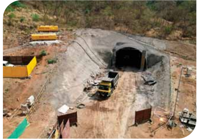
Work in progress for India's First Undersea Rail Tunnel in Maharashtra

Aesthetically, the MAHSR stations serve as architectural masterpieces, reflecting the unique cultural ethos of their locales. From the vibrant kite-inspired facade of Ahmedabad's station to the contemporary architectural finishes adorning each structure, every station exudes a sense of pride and identity, fostering a deep connection with the local populace.